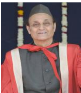
95 th Convocation – 2013 Hon'ble Chancellor, BHU Dr. Karan Singh