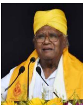
99 th Convocation – 2017 Bharat Ratna Prof. C N R Rao, FRS