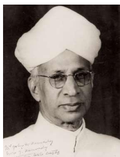
Dr. S Radhakrishnan