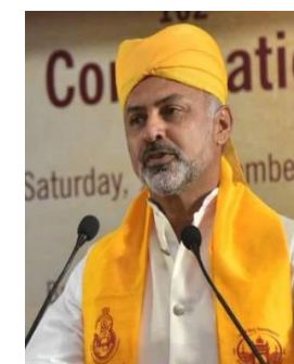
102 nd Convocation – 2022 Chairman & CEO Palo Alto Net. Shri Nikesh Arora