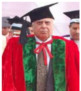
93 rd Convocation – 2011 Hon'ble Minister of HRD Shri Kapil Sibal