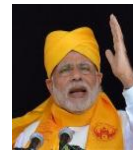
98 th Convocation – 2016 Hon'ble Prime Minister of India Shri Narendra Modi