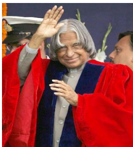
88 th Convocation – 2006 Hon'ble President of India Dr. A.P.J. Abdul Kalam