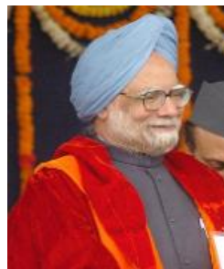
90 th Convocation – 2008 Hon'ble Prime Minister of India Dr. Manmohan Singh