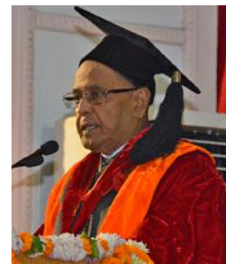
Special Convocation – 2012 Hon'ble President of India Shri Pranab Mukherjee