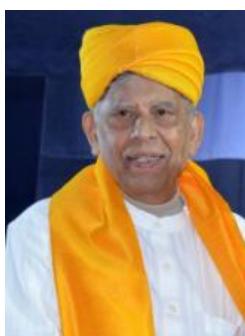
101 st Convocation – 2019 Padma Vibhushan Dr. Vijay Kelkar