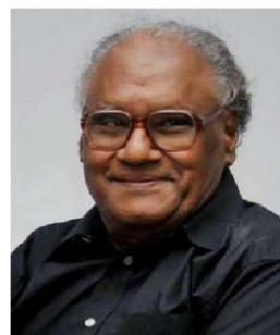
Prof. C.N.R. Rao