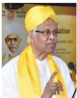
100 th Convocation – 2018 Padma Vibhushan Dr. Raghunath A Mashelkar, FRS