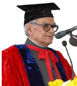
89 th Convocation – 2007 Hon'ble Vice-President of India Shri Bhairon Singh Shekhawat