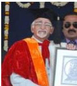
92 nd Convocation – 2010 Hon'ble Vice-President of India Shri Hamid Ansari