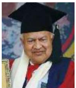
96 th Convocation – 2014 Padma Vibhushan Prof. Jayant Vishnu Narlikar