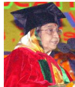
91 st Convocation – 2009 Hon'ble Vice-President of India Smt. Pratibha Devi Singh Patil