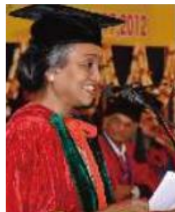
94 th Convocation – 2012 Hon'ble Speaker of Lok Sabha Smt. Meira Kumar