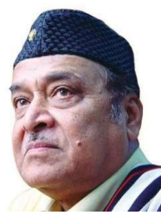
Shri Bhupen Hazarika