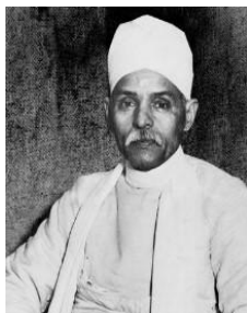
Pt. Madan Mohan Malaviya