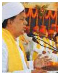
97 th Convocation – 2015 Padma Vibhushan Dr. G Madhavan Nair