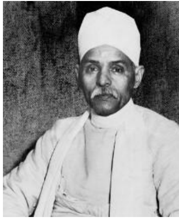
Pt. Madan Mohan Malaviya