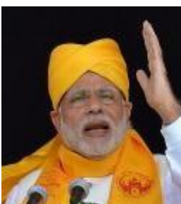
98 th Convocation 2016 Hon'ble Prime Minister of India Shri Narendra Modi