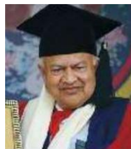
96 th Convocation – 2014 Padma Vibhushan Prof. Jayant Vishnu Narlikar