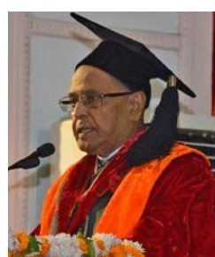
Special Convocation 2012 Hon'ble President of India Shri Pranab Mukherjee