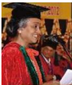
94 th Convocation 2012 Hon'ble Speaker of Lok Sabha Smt. Meira Kumar