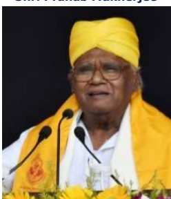
99 th Convocation 2017 Bharat Ratna Prof. C N R Rao, FRS