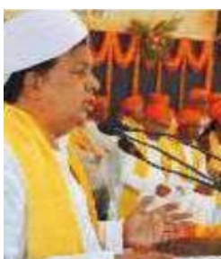
97 th Convocation 2015 Padma Vibhushan Dr. G Madhavan Nair