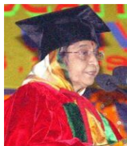
91 st Convocation 2009 Hon'ble Vice-President of India Smt. Pratibha Devi Singh Patil