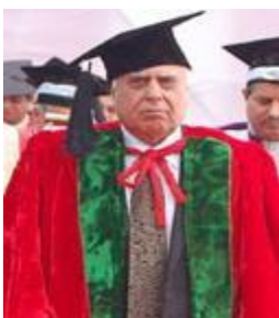
93 rd Convocation 2011 Hon'ble Minister of HRD Shri Kapil Sibal