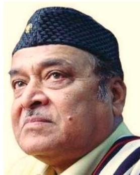
Shri Bhupen Hazarika