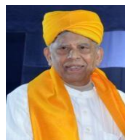
101 st Convocation 2019 Padma Vibhushan Dr. Vijay Kelkar