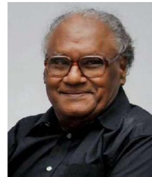
Prof. C.N.R. Rao