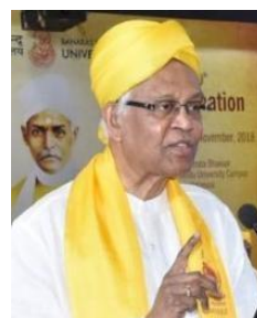
100 th Convocation 2018 Padma Vibhushan Dr. Raghunath A Mashelkar, FRS