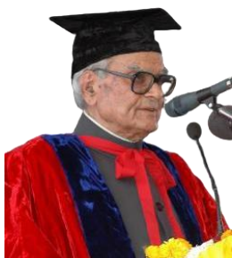
89 th Convocation 2007 Hon'ble Vice-President of India Shri Bhairon Singh Shekhawat