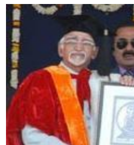
92 nd Convocation 2010 Hon'ble Vice-President of India Shri Hamid Ansari