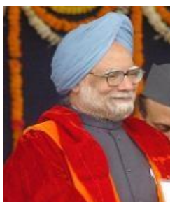
90 th Convocation 2008 Hon'ble Prime Minister of India Dr. Manmohan Singh