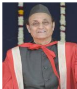
95 th Convocation 2013 Hon'ble Chancellor, BHU Dr. Karan Singh