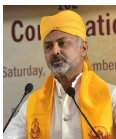
102 nd Convocation 2022 Chairman & CEO Palo Alto Net. Shri Nikesh Arora