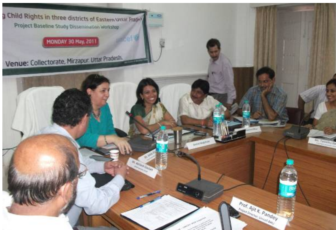
Protection of Child Rights Project (Workshop on 30 May 2011 at Mirzapur Distt.)