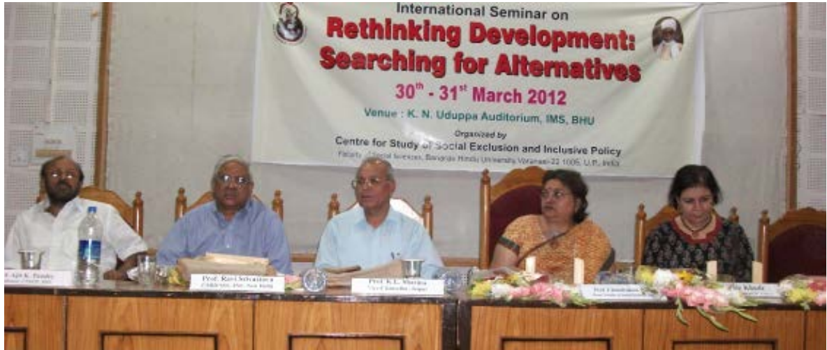
International Seminar on “ Rethinking Development: Searching for Alternatives ” held on 30 th -31 st March 2012