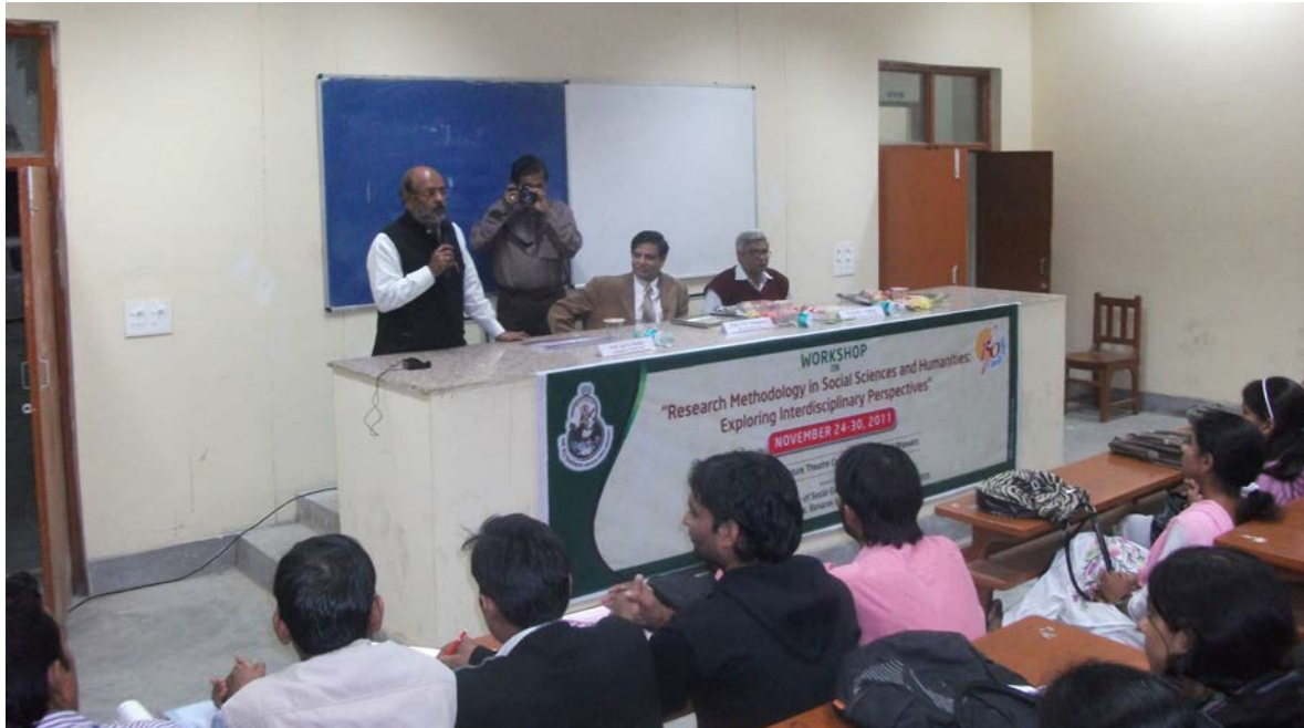
Workshop on “ Research Methodology in Social Sciences and Humanities: Exploring interdisciplinary perspectives ” during the period 24 th – 30 th November 2011