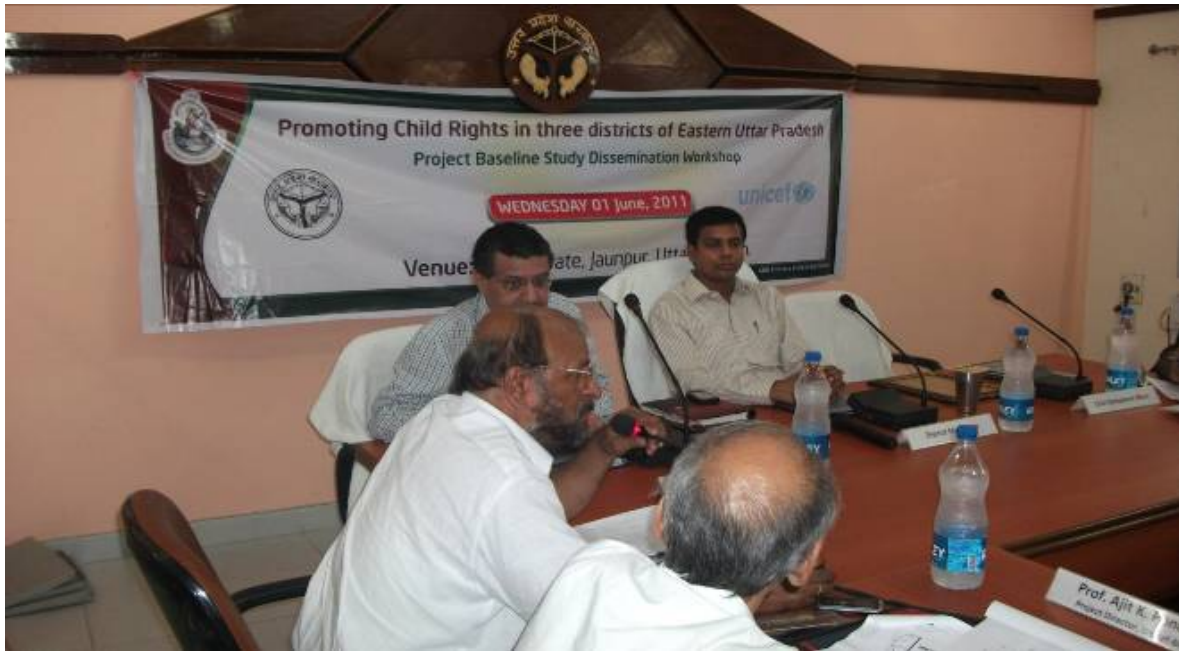
Protection of Child Rights Project (Workshop on 01 June 2011 at Jaunpur Distt.)