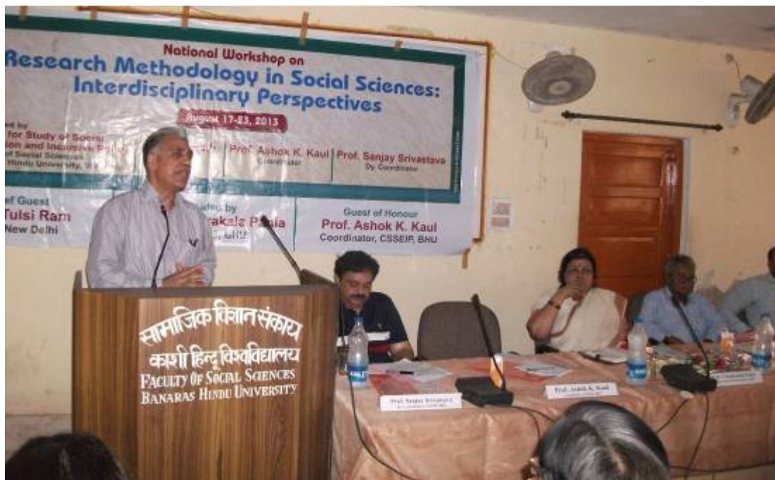
National Workshop on Research Methodology in Social Sciences: Interdisciplinary Perspectives held from 17 th August to 23 rd August 2013