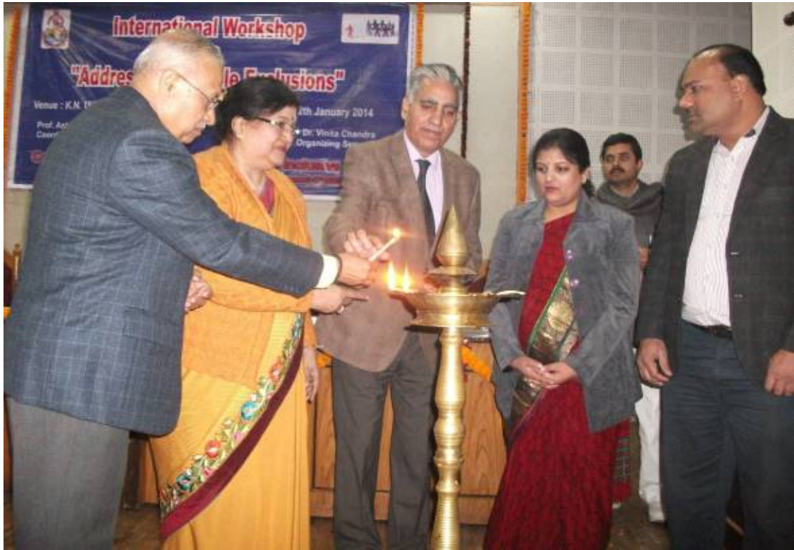
Workshop on 'Addressing Multiple Exclusions' held from 06 th – 12 th January 2014