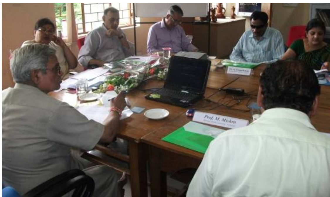
Workshop on syllabus framing held from 29 th August to 30 th August 2013